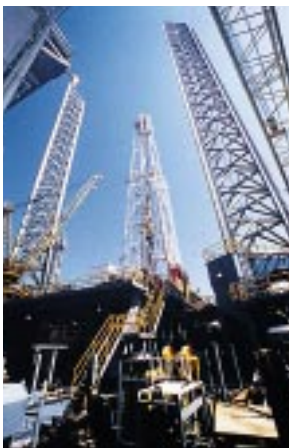
Incorporating a half-century of production data from hundreds of wells, the POWERS model presents a virtual picture of complex reservoirs.

Saudi Aramco chose the 15th World Petroleum Congress in Beijing (see related story, this issue) to announce the development of a Parallel Oil-Water-Gas-Reservoir Simulator (POWERS). Delegates to the influential industry conference were among the first to see how Saudi Aramco, faced with its mandated responsibility to manage the Kingdom’s hydrocarbon reservoirs for maximum performance, developed the POWERS simulator.